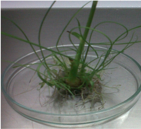
Picture 3. Rooted plantlets regenerated from meristem apical explants.

At the meristem apical cultures, no roots were observed in the medium containing cytokinin, therefore, the elongated shoots were transferred to medium supplemented with NAA 2 mg/l.